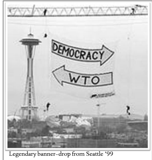
Legendary banner-drop from Seattle '99

It has been ten years since riots and protests rocked the WTO meetings in Seattle in 1999. We're going to talk about a couple movies with two different perspectives on the actions of Nov 29-Dec 2, 1999.